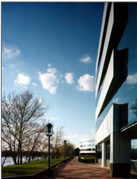
Riverview Executive Park

Advance completed the acquisition of this 330,000 square foot office complex, and then negotiated with the State of New Jersey to increase its leased space in the property to 300,000 square feet for a term of 25 years. At the same time, the company agreed to construct a 930-car parking deck, which would not only solve a parking problem for the State's workers in its three buildings, but also allow Mercer County to comply with its contractual obligation to Waterfront Park, the 6,500-seat minor league baseball stadium for the Trenton Thunder, adjacent to the site. Advance structured an arrangement to share the cost of the parking deck, providing a cost-effective and value-enhancing solution for all parties. This public/private working relationship is now moving forward with plans for $100 million of future waterfront development comprising an additional 400,000 square feet of office and retail space, and additional structured parking.